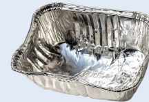
metal, aluminum metal, aluminio