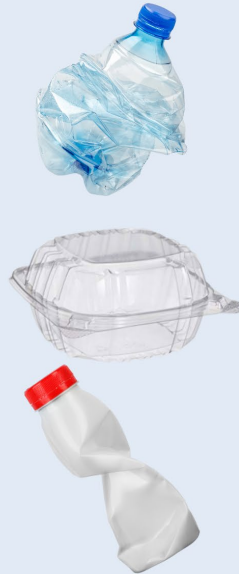
plastics #1, 2, 5 plástico #1, 2, 5