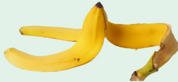
fruits, vegetables frutas, vegetales