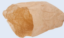
paper, cardboard papel, cartón