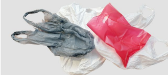
plastic wrappers & bags envolturas, bolsas de plastico