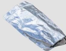
cartons, juice pouches cartones, bolsas de jugo