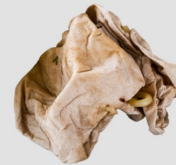
utensils, napkins utensilios, servilletas