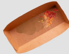
dirty trays & containers platos y contenedores sucios