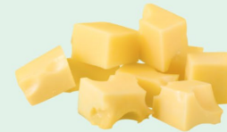
cooked meats, dairy carne cocida, lácteos